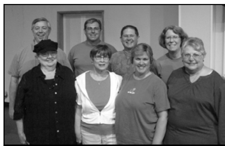
Winning team - The Russellville Johnnies

some sliders that would put several national chains to shame. A good time was had by all, and running away with first place was the team from St. John's Russellville. A total of $2,700 was raised for the general operations of the camp.